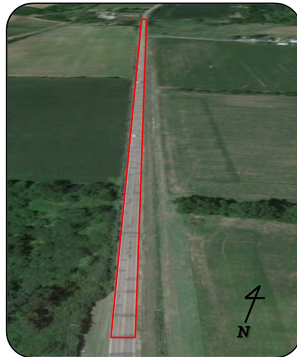
Aerial View of Proposed Project