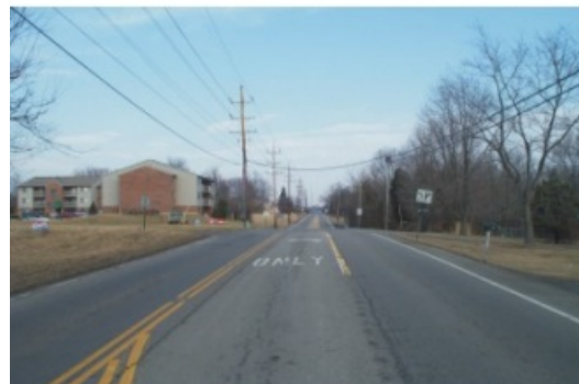
US 27 south of Oxford