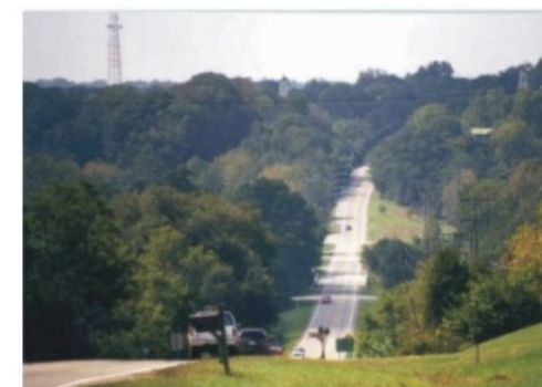
SR 73 east of Oxford