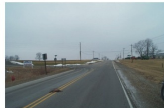
US 27 north of Oxford