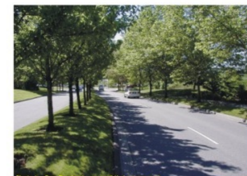
Example of parkway-type roadway