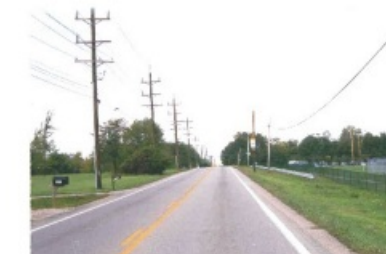
US 27 at Maud Marshall Elementary