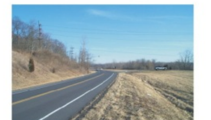
US 27 at Ross Millville Road