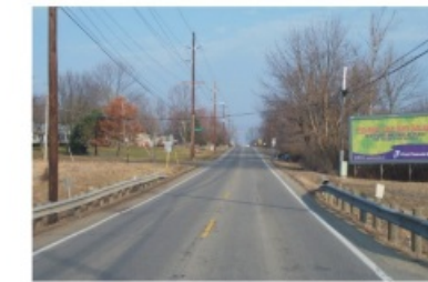
US 27 South of Booth Road