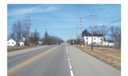
US 27 at Stahlheber Road