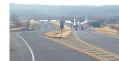
US 27 at SR 128 looking south