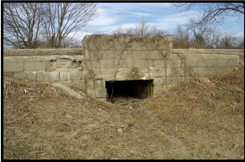
Bunker Hill Woods Road Culvert #00.386