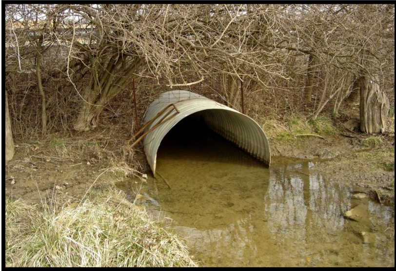
Tylersville Road Culvert #06.044