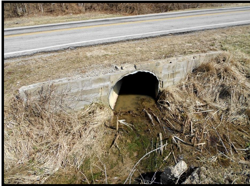
Alert New London Road Culvert #03.258