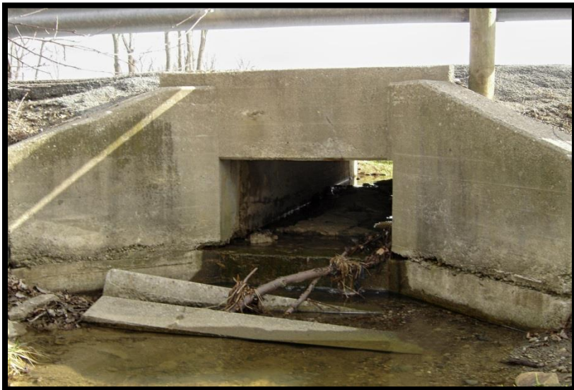
West Alexandria Road Culvert #01.698