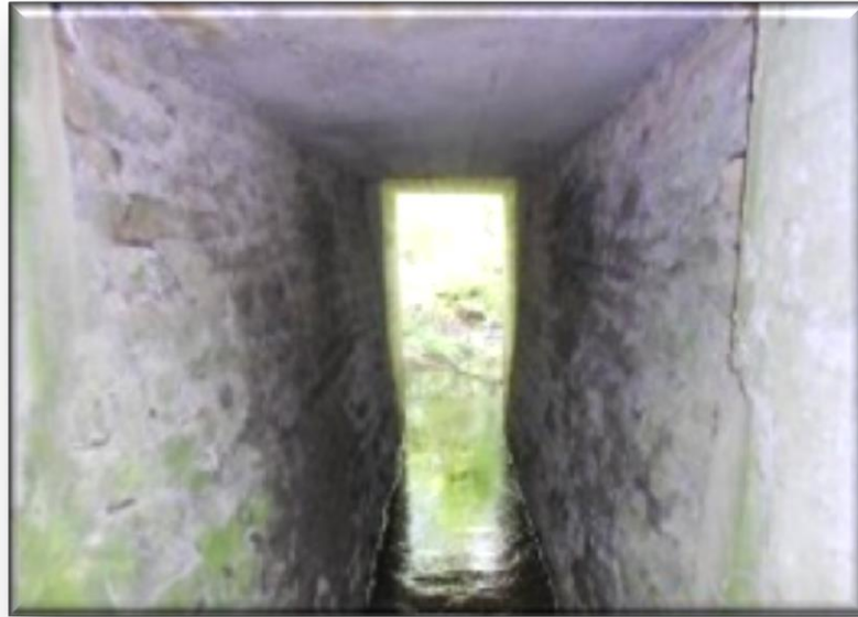
Hamilton Mason Road Culvert #05.452