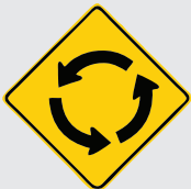
Roundabout ahead, slow down.

As you get closer to the roundabout entrance, it is very important to observe the signs and arrows to determine which lane to use before entering a roundabout. Signs above the road and white arrows on the road will show the correct lane to use.