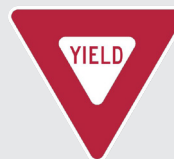
Yield to all traffic in the roundabout.