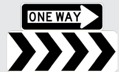
Roundabout traffic travels one-way.