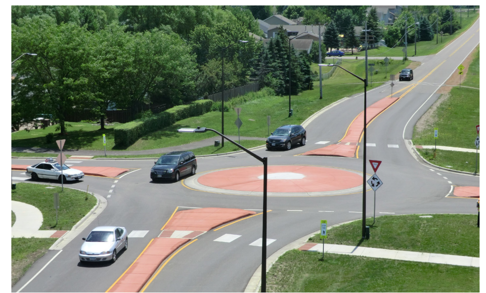
Example of a single-lane roundabout.

1 AASHTO. The Highway Safety Manual, American Association of State Highway Transportation Professionals, Washington, D.C., (2010).