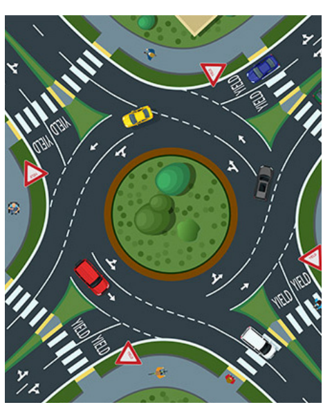
Illustration of a multilane roundabout.

Roundabouts can be implemented in both urban and rural areas under a wide range of traffic conditions. They can replace signals, twoway stop controls, and all-way stop controls. Roundabouts are an effective option for managing speed and transitioning traffic from highspeed to low-speed environments, such as freeway interchange ramp terminals, and rural intersections along high-speed roads.