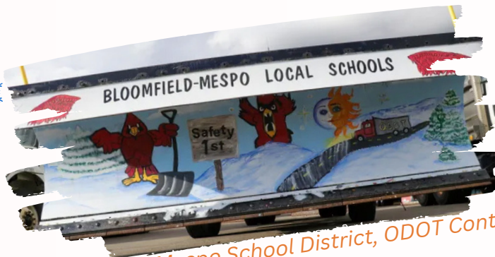
Bloomfield Mespo School District, ODOT Contest