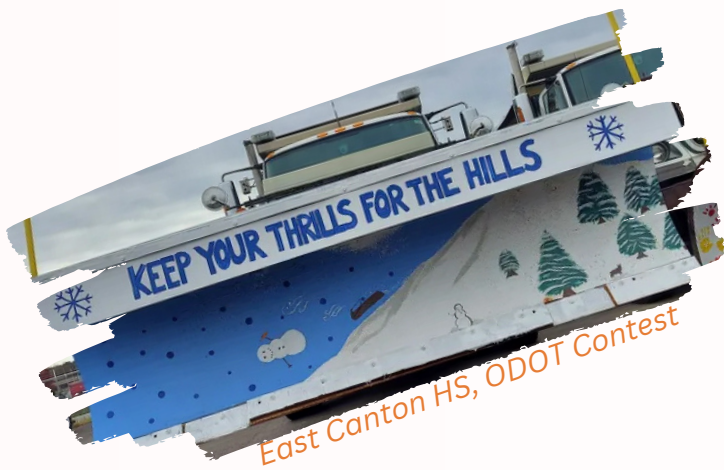
East Canton HS, ODOT Contest