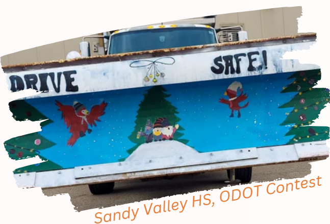
Sandy Valley HS, ODOT Contest

Blade Pick-up Deadline: Blades will be picked up no later than October 10, 2025