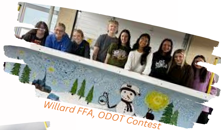
Willard FFA, ODOT Contest